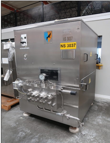
Niro-Soavi Type S3037H Homogenizer