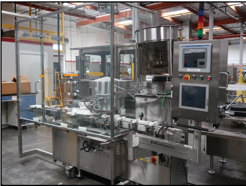
2011 Genesis Packaging Technologies PW600NSRSD Bottle Filling Line