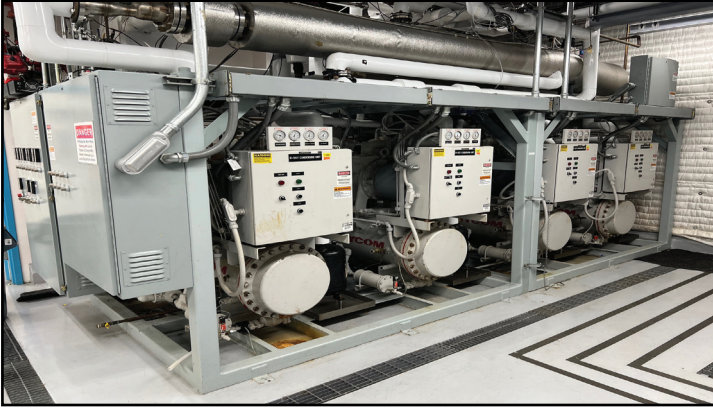
Mayekawa Mycom mdl. 37H1410SSC 4 Head Screw Compressor System w/ Allen Bradley Controls.