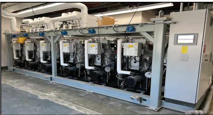
Mayekawa Mycom mdl. 37H1410SSC 5 Head Screw Compressor System w/ AllenBradley Controls.