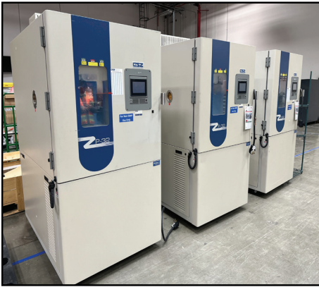
(3) Cincinnati Sub Zero CSZ mdl. ZP-32-35SCT/AC Sub Zero Environmental Chambers. Dual Barrel Tumbler **3-AVAILABLE**