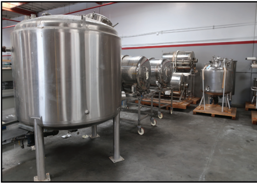
Storage and Transfer Tanks

PRESORTED First-Class Mail U.S. Postage PAID STA CLARITA, CA Permit No. 298