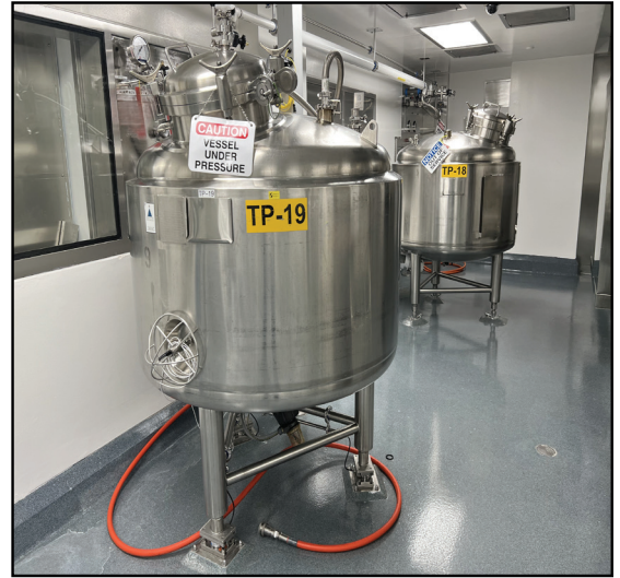
(2) 1999 Precision Stainless Jacketed 304L 316 Stainless Steel Tanks.