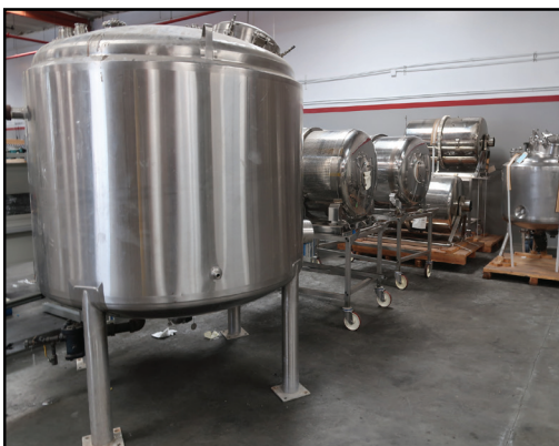
Storage and Transfer Tanks

Malvern Archimedes RMM2001 Affinity Biosensor for Particle Counting.