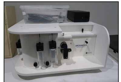
Malvern Archimedes RMM2001 Affinity Biosensor for Particle Counting