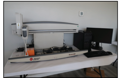
Beckman Coulter Biomek 4000 Workstation Automated Liquid Handler