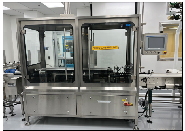
2012 Penn-Tech EVW-200 (SP-HULL) External Vial Washer