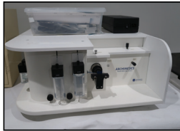
Malvern Archimedes RMM2001 Affinity Biosensor for Particle Counting