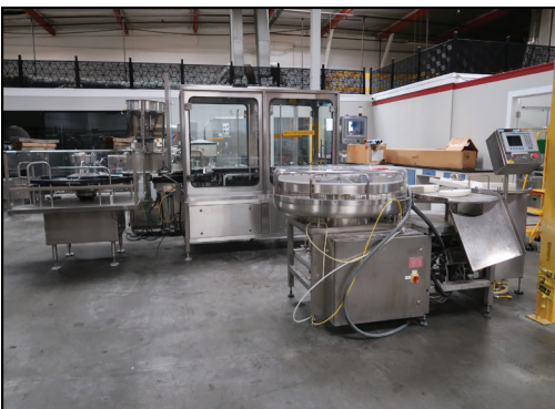
Vial Washing Equipment

2022 (NEW) Rongyu RY-ZH-80 Packaging Machine s/n 220302 w/Siemens Smart Line Touch Controls, RY-BZ-3 Carton Weighing Machine, RY-BZ-4 Carton Sealing Labeling Machine, RY-TB-120 Labeling Machine, RY-CZ-2000 Weighing Machine, RY-KX-500 Carton Forming / Taping Machine with Siemens Controls, RY-SFX-50.