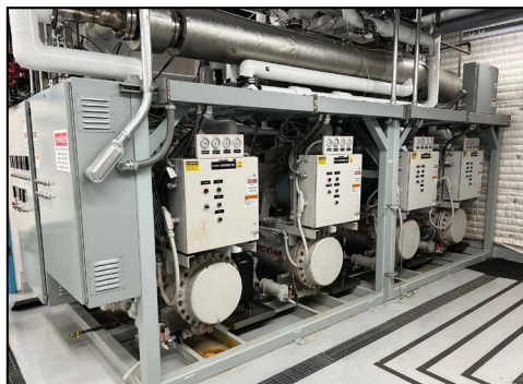
Mayekawa Mycom mdl. 37H1410SSC 4 Head Screw Compressor System w/ Allen Bradley Controls.