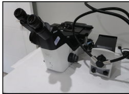
Nikon Eclipse MA100N Brightfield Inverted Microscope