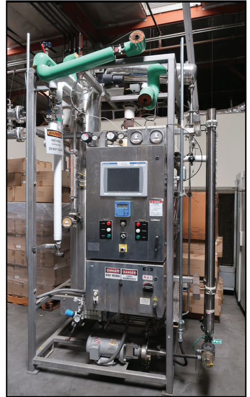
2006 Steris Finn-Aqua Steam Generator w/ Allen Bradley PLC Controls