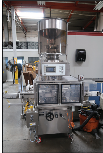
The West Co mdl. RW600SF St Vial Capping Line