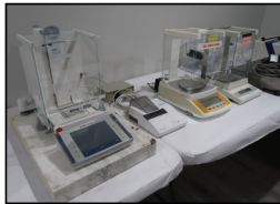
Mettler Toledo Digital Balance Scales