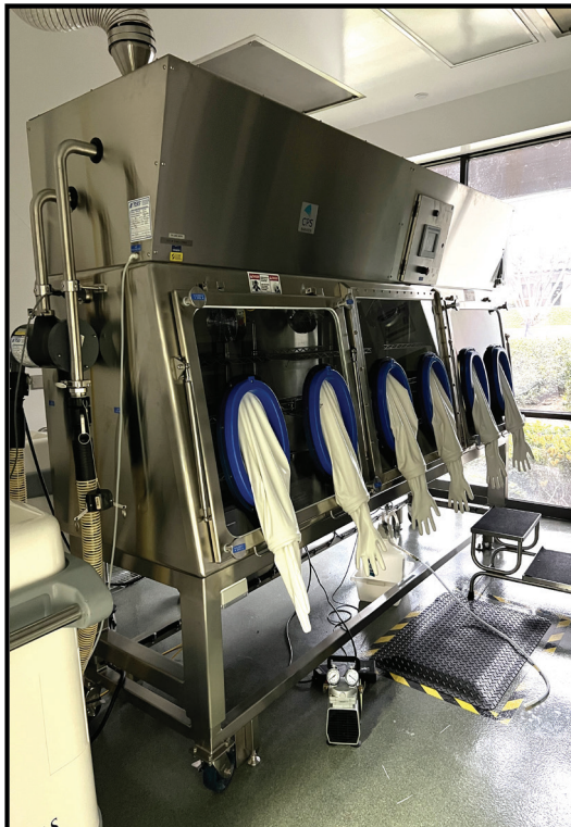
2006 Sterility Test 3-Station – 6-Glove Isolation Booth s/n 33640-1 w/ PLC Controls