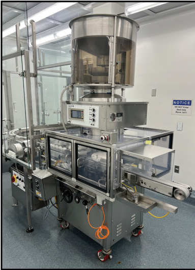
The West Co mdl. RW600SF St Vial Capping Line