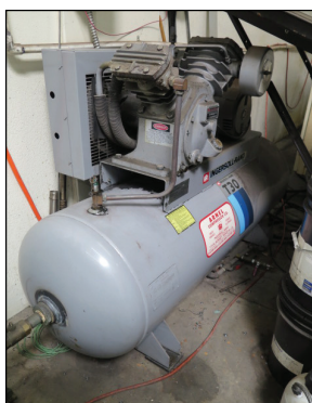
Ingersoll Rand T30 5HP Horizontal Air Compressor