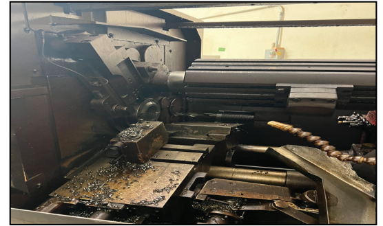
Wickman 31/2 Single Speed Automatic Lathe, Bar Feed with Stand.