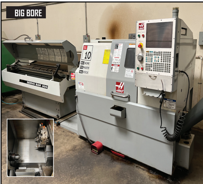
2007 Haas SL-10B Big Bore CNC Turning Center, 2" Bar Capacity, 12 Station Turret, with Haas Tool Presetter, Haas Servo Bar 300 Bar Feeder, s/n 3076238.