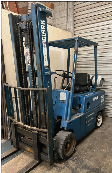
Clark C500 LPG Forklift, 6000 lb Capacity, 2 Stage.