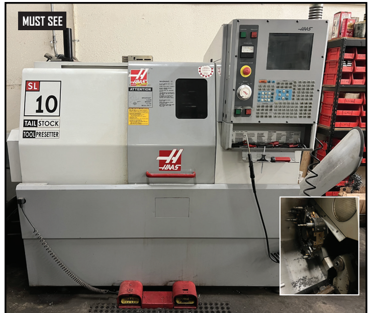
2003 Haas SL-10T CNC Turning Center, 1.75" Bar Capacity, 12 Station Turret, Tail Stock, s/n 65836.