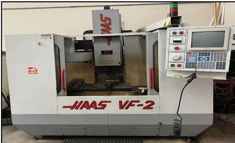
Haas VF-2 CNC VMC, 30" x 16" x 20" (XYZ), Haas Controls, 40 Taper, s/n 5548.