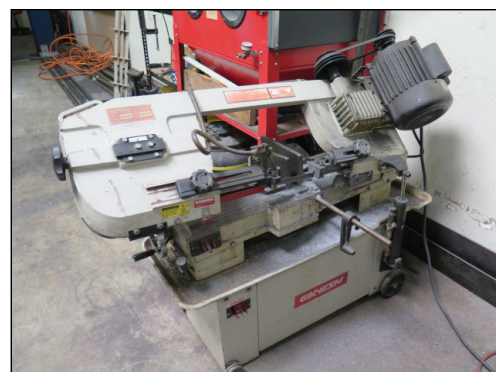
Ganesh Horizontal Band Saw.