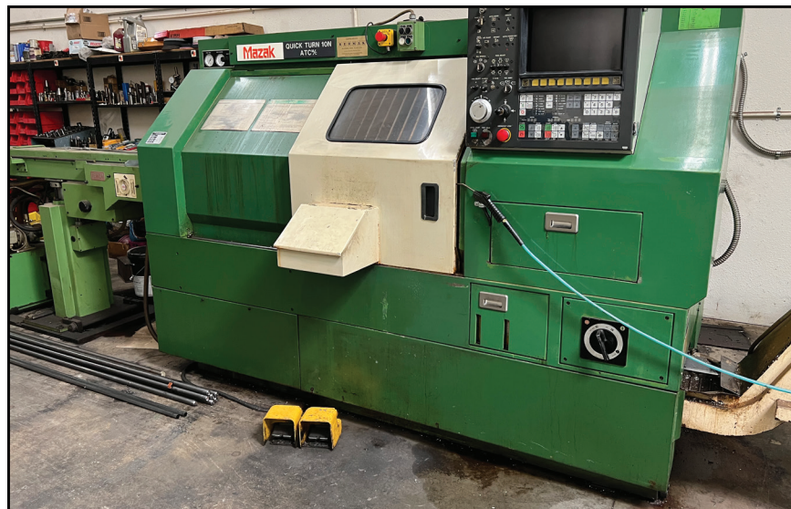
Mazak Quick Turn 10N ATC-M/C CNC Turning Center, w/ IEMCA Bar Feeder, Mazatrol CAM T-3 Control, 1.86" Bar Capacity, 8" Chuck.