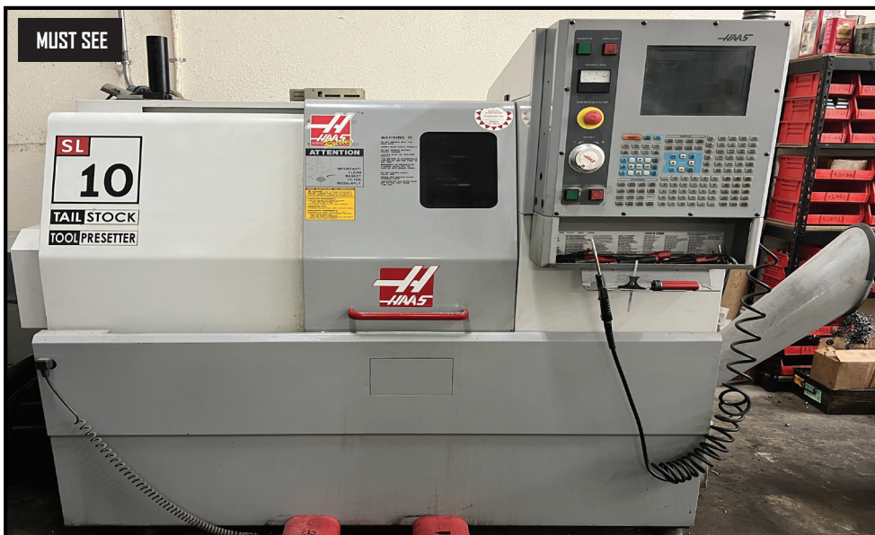
2003 Haas SL-10T CNC Turning Center, 1.75" Bar Capacity, 12 Station Turret, Tail Stock, s/n 65836.