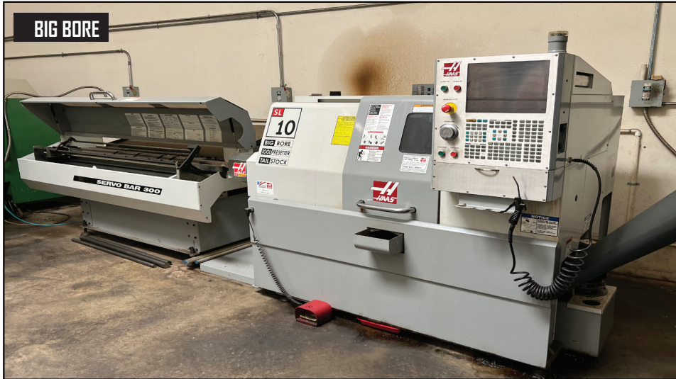
2007 Haas SL-10B Big Bore CNC Turning Center, 2" Bar Capacity, 12 Station Turret, with Haas Tool Presetter, Haas Servo Bar 300 Bar Feeder, s/n 3076238.