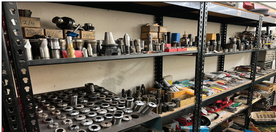
Large Selection of CNC Tooling and Inspection.