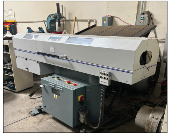
Nakamura-Tome TMC 15 CNC Lathe, with Fanuc Control, 10 Station Turret, w/ Hydrafeed Multifeed ML1 Short Magazine CNC Barfeed.