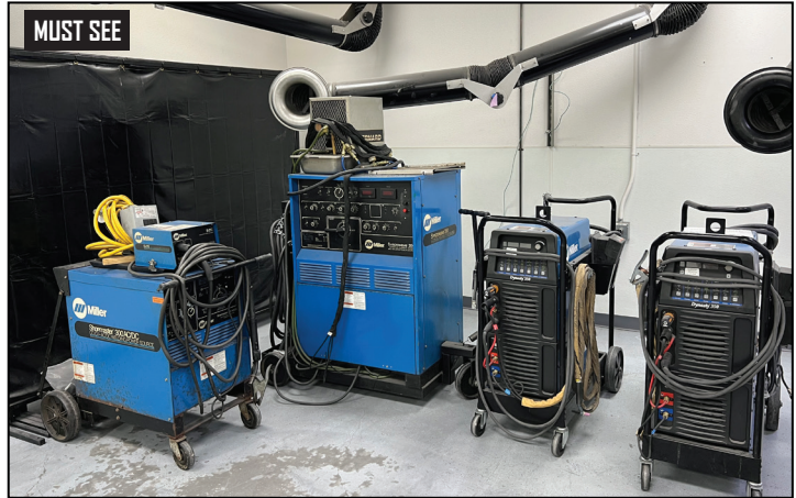
Miller Dynasty 350 Tig Welders, Miller Syncrowave 350 Tig Welder, Miller Shopmaster 300 AC/DC Mig Welder.