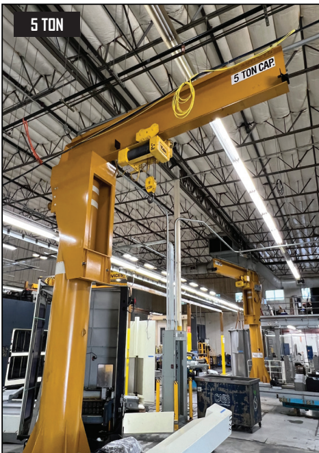
5 Ton Jib Crane with Yale Electric 5 Ton Hoist System.