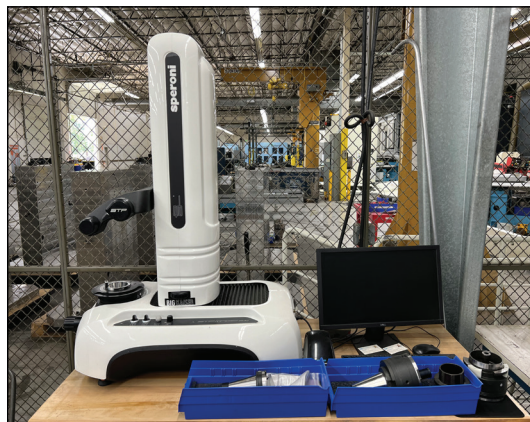
1of 2) Speroni Big Kaiser STP Tool Presseter and Measuring System.