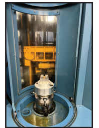
Dec-2016 Matsura MAM72-35Vn-PC32, 5 Axis CNC Machining Center, 32 Pallets, 20,000 RPM, 25 HP, 320 ATC, Renishaw OMP 400 IMP Probe, with Cooljet System, Chip Conveyor, BT-40, 21.65" x 17.32" x 22.83" (xyz), 5 Axis Trunnion Table, (See Under Power in Milpitas, CA).