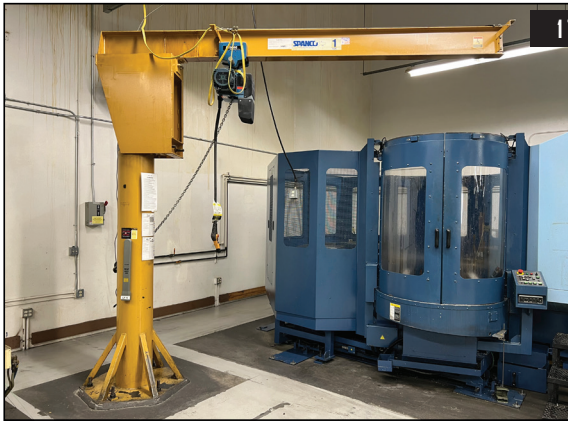
Spanco 1 Ton Jib Crane.