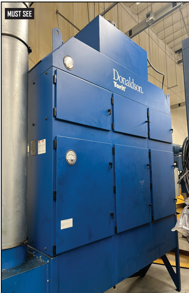
Torit Donaldson WSO 25-3 Mist Collector, 10 HP