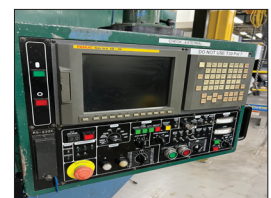
Kasuga Quantum Q-2000V CNC VMC, 50 Taper, 80" x 30" x 20" (XYZ), 30 ATC, Fanuc 18I-M Control, Dual Chip Conveyor, 6000 RPM, 3 Axis.