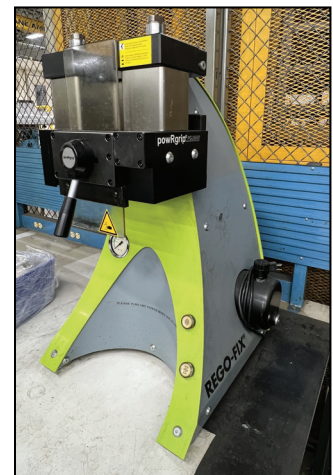
Rego-Fix PowRgrip PGU 9000 Clamping Unit.