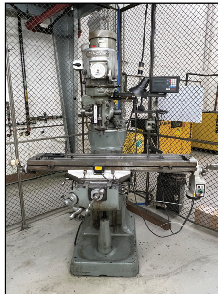
Bridgeport Vertical Milling Machine w/ DRO and Power Feed Table, Variable Speed, 1.5 HP.