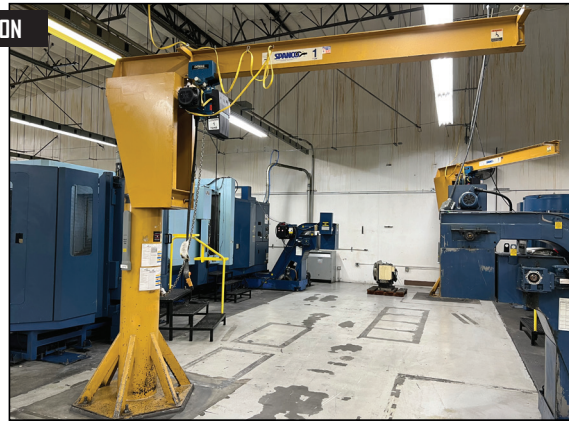
Spanco 1 Ton Jib Crane.