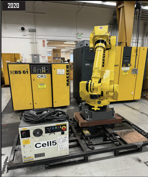
2020 Fanuc M-710iC 6 Axis Robot System, w/ R 301B Plus Control, Type A05B-2610-B222.