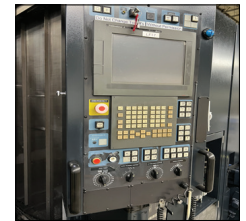
2006 Makino A100E-5XR CNC Horizontal Machining Center, 1000 mm Dual Pallet, 39.4" x 39.4" Pallet Size, 66" x 53" x 55" (XYZ), 132 ATC, 18,000 RPM, CAT 50, Makino Professional 5 CNC Control, Full 4th Axis, 40 HP, Chip Conveyor, 1000 PSI High Pressure Coolant.