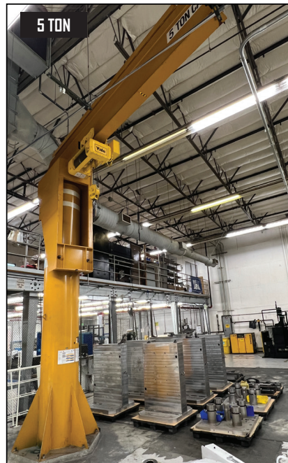
5 Ton Jib Crane with Yale Electric 5 Ton Hoist System.