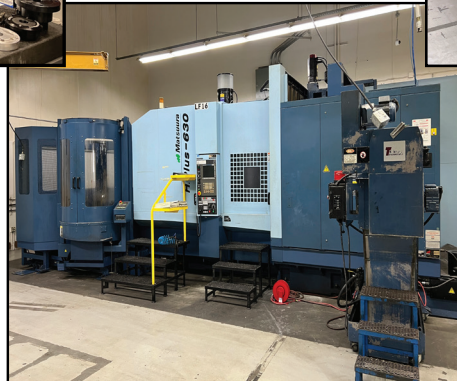
2011 Matsura H. PLUS-630 PC6 CNC HMC, 630 mm Pallet, 24.8" x 24.8" Pallet Size, 6 Pallet Pull System, 41" x 36" x 34" (XYZ) 180 ATC, CAT 50, 12,000 RPM, Matsura G-Tech 16i (Fanuc) Control, 40 HP, Chip Conveyor, Full 4th Axis, Pallet Load Capacity 2640 Lbs,