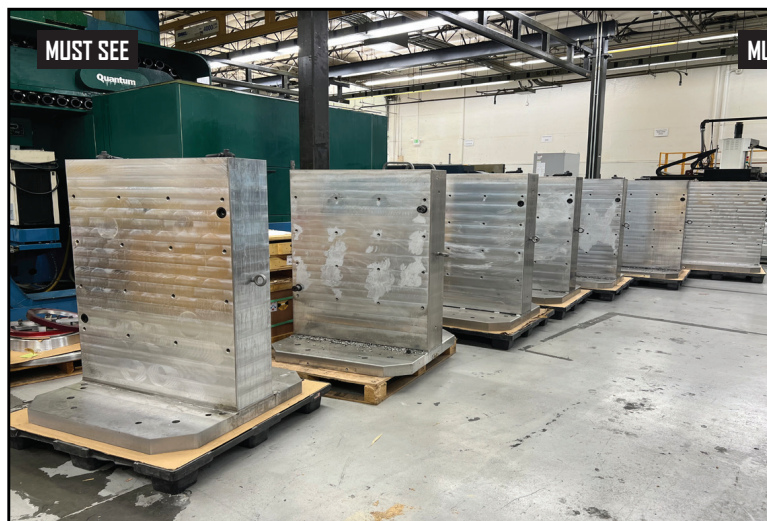
Large Selection of 1000 mm Tombstones.