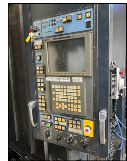
2003 Makino A100E CNC Horizontal Machining Center, 1000 mm Dual Pallet, 39.4" x 39.4" Pallet Size, 66" x 53" x 55" (XYZ), 132 ATC, 12,000 RPM, CAT 50, Makino Professional 3 CNC Control, Full 4th Axis, 40 HP, Chip Conveyor, 1000 PSI High-Pressure Coolant.