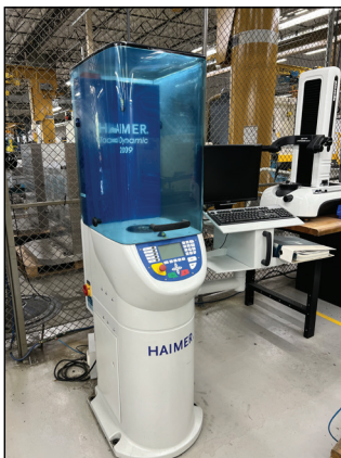
1of 2) Haimer Tool Dynamic 2002 Tool Balancing Machine