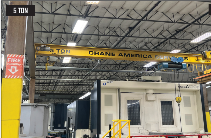
Crane America Services 5 Ton Crane System, Traveling Column.