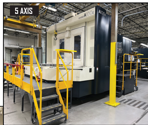
2006 Makino A100E-5XR CNC Horizontal Machining Center, 1000 mm Dual Pallet, 39.4" x 39.4" Pallet Size, 66" x 53" x 55" (XYZ), 132 ATC, 18,000 RPM, CAT 50, Makino Professional 5 CNC Control, Full 4th Axis, 40 HP, Chip Conveyor, 1000 PSI High Pressure Coolant.