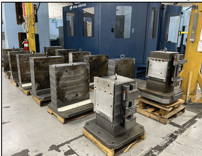
Large Selection of 630 mm Tombstones.