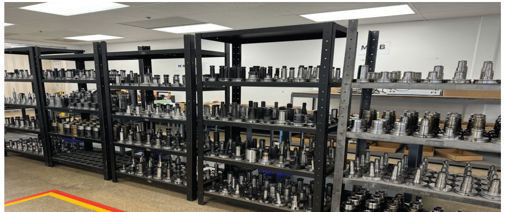
100'S OF HSK CT 40 AND CT 50 TOOL HOLDERS