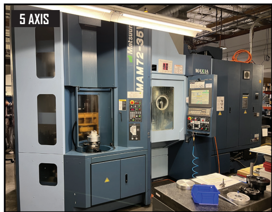
Dec-2016 Matsura MAM72-35Vn-PC32, 5 Axis CNC Machining Center, 32 Pallets, 20,000 RPM, 25 HP, 320 ATC, Renishaw OMP 400 IMP Probe, with Cooljet System, Chip Conveyor, BT-40, 21.65" x 17.32" x 22.83" (xyz), 5 Axis Trunnion Table, (See Under Power in Milpitas, CA).