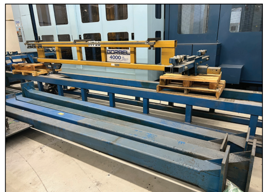
Gorbel 4000 lb Capacity Traveling Column Crane System. (Moved to Livermore, CA from Fremont, CA for Convenience of Sale)