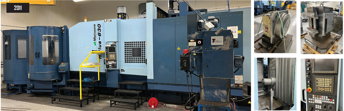
2011 Matsuura H. PLUS-630 PC6 CNC HMC, 630 mm Pallet, 24.8" x 24.8" Pallet Size, 6 Pallet Pull System, 41" x 36" x 34" (XYZ) 180 ATC, CAT 50, 12,000 RPM, Matsuura G-Tech 16i (Fanuc) Control, 40 HP, Chip Conveyor, Full 4th Axis, Pallet Load Capacity 2640 Lbs,