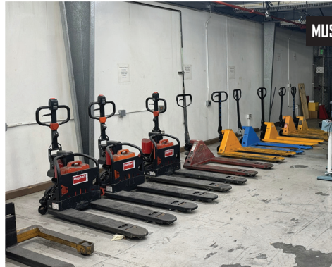
Large Selection of Electric and Manual Pallet Jacks