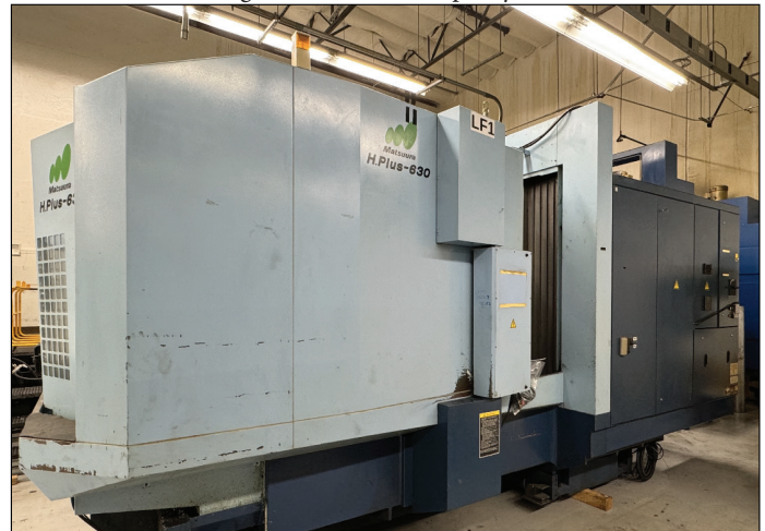
2003 Matsuura H. PLUS-630 Dual Pallet CNC HMC, 12,000 RPM, CAT 50, 41.33" x 36.22" x 38.97" (XYZ), 117 ATC, Fanuc 16iM Control, 24.8" x 24.8" Pallet Size, N/C Contouring 4 Axis Table Indexing, Chip Conveyor, (Moved to Livermore, CA from Fremont, CA for Convenience of Sale)