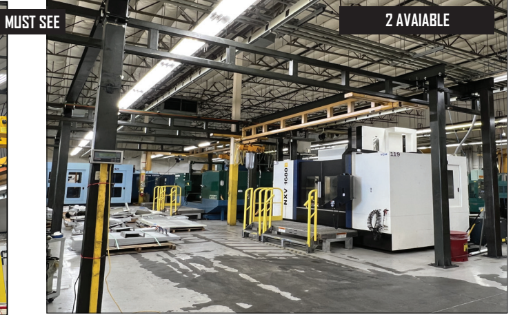
2) Spanco 4000 lb Capacity Traveling Column Crane System.