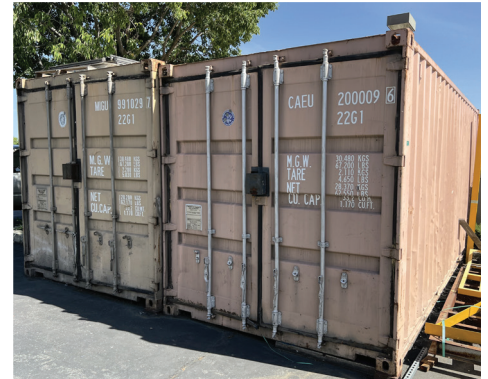
2) 20 FT Sea Containers for Storage

ALL MACHINERY MOVERS MUST BE APPROVED BY THE SELLER PRIOR TO REMOVAL OF EQUIPMENT