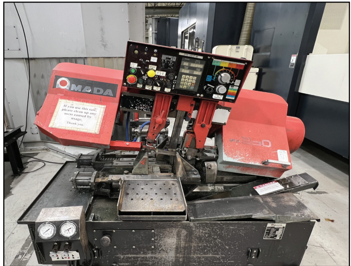
1992 Amada HFA 250W Horizontal Band Saw, with Conveyor.