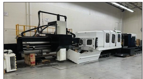
HMG) 2018 HMG HAS-423EAY Double Column Bridge Type Machining Center, 10,000 RPM, 157.48" x 122.03" x 39.37" (XYZ), 32 ATC, BT 50, Table Size 157.48" x 86.61", Spindle Nose to Table Top (13.78" -53.15"), Fanuc OIMF Control, Chip Conveyor, (Moved to Livermore, CA from Fremont, CA for Convenience of Sale)