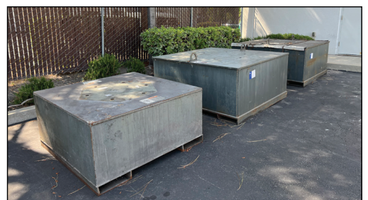
3) Counter Weights for Lifting used with Cranes.