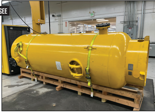
2018 Air Tank