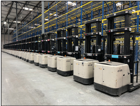
OVER 40 CROWN SP3520 SERIES ELECTRIC STOCK PICKERS.