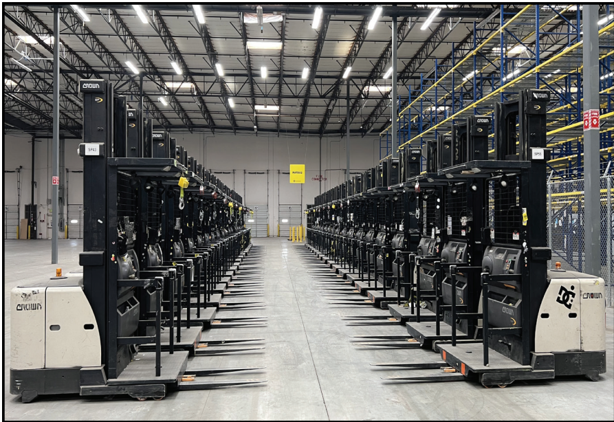
OVER 40 CROWN SP3520 SERIES ELECTRIC STOCK PICKERS.