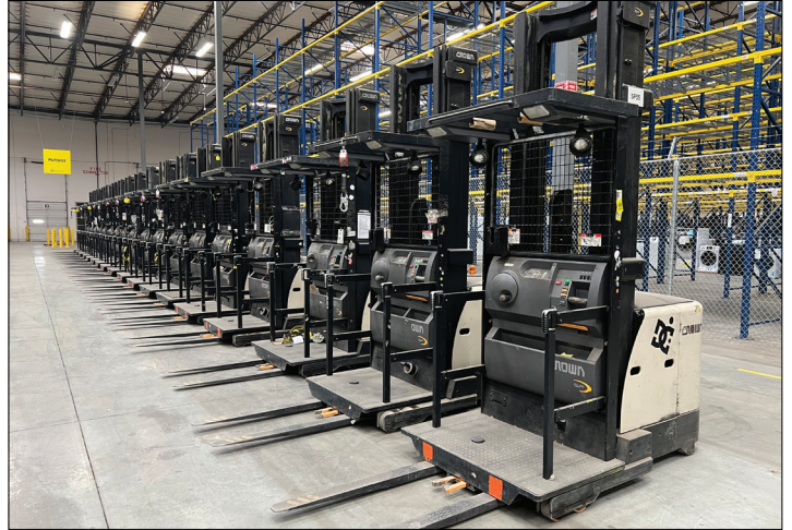
Crown SP3520 Series Electric Stock Pickers