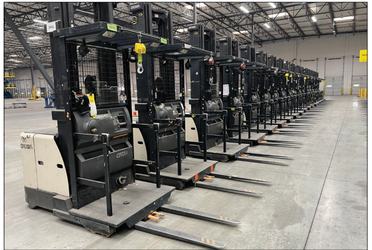
Crown SP Series Stock Pickers