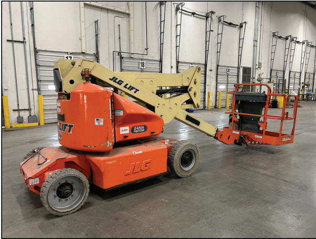
2006 JLG MODEL E400AN ARTICULATING BOOM LIFT, 500 LB CAPACITY, 48V, 40FT MAX PLATFORM HEIGHT, 21.2 FT MAX HORIZONTAL REACH.