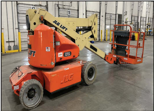
2006 JLG MODEL E400AN ARTICULATING BOOM LIFT, 500 LB CAPACITY, 48V, 40FT MAX PLATFORM HEIGHT, 21.2 FT MAX HORIZONTAL REACH.