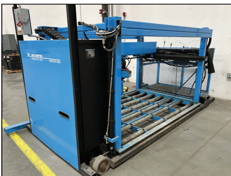
2021 MULTI SHIFTER DST2-44L 10,000 LB CAPACITY BATTERY CHANGER / SHIFTER.