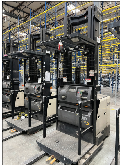
CROWN SP3520-30 3000 LB CAPACITY STOCK PICKERS.

(6) Crown 5200 Series 3500 Lb Cap Tall Mast Stand-In Electric Reach Forklift w/ 300" Lift Height, Extendable Forks, Side Shift (NO BATTERY).