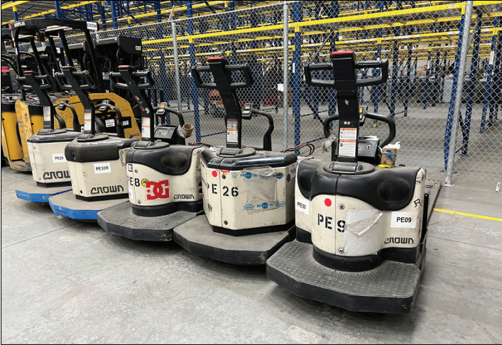
Crown Electric PE 4500 And PE 3500 Series Electric Pallet Jacks.