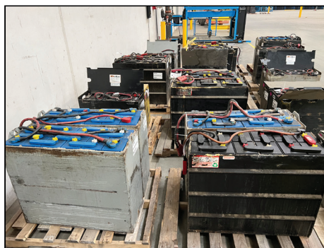
LARGE SELECTION OF ELECTRIC FORKLIFT BATTERIES.