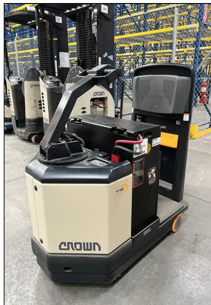
Crown TR 4500 Series Electric Tug, 24 Volt.