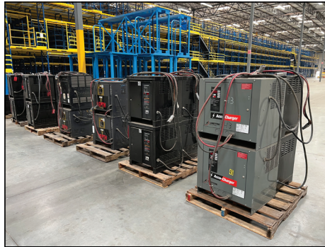
LARGE SELECTION OF ELECTRIC CHARGERS.