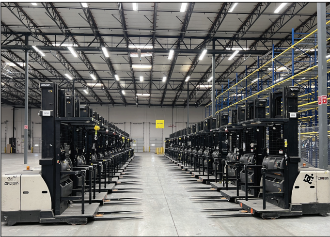
Crown SP Series Stock Pickers