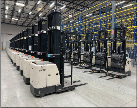
OVER 40 CROWN SP3520 SERIES ELECTRIC STOCK PICKERS.

PREVIEW MORNING OF SALE FROM 8:00 a.m-11:00 a.m "On-line bidding thru bidspotter.com"