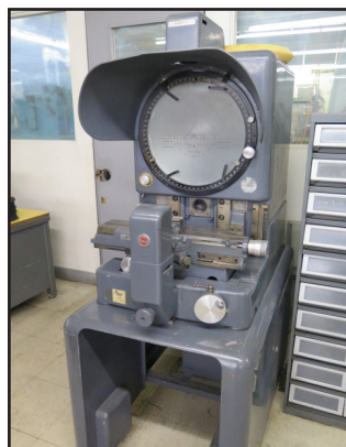
Kodak mdl. 2A 14" Optical Comparator