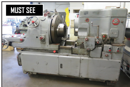
Fellows mdl. Z Horizontal Gear Shaper w/ 19" Slide Travel, 5" Stroke