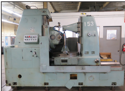
Lansing GH50 50" Universal Gear Hobbing Machine w/ 18-185 RPM, 36" Dia Table