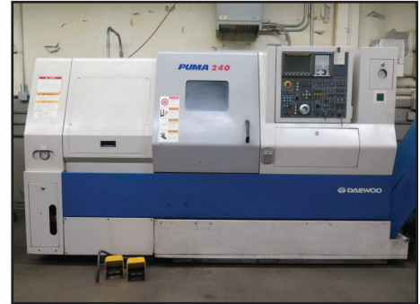
2004 Daewoo PUMA 240 CNC Turning Center w/ Fanuc I Controls, Tool Presetter, 12-Station Turret, Tailstock, 8" Power Chuck