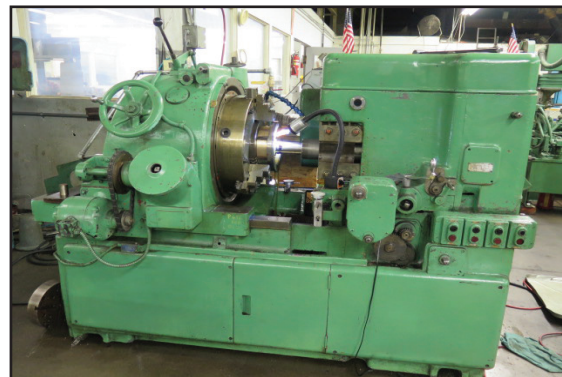
Fellows mdl. Z Horizontal Gear Shaper w/ 20" 2-Jaw Chuck, 19" Slide Travel, 5" Stroke