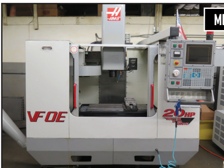
2000 Haas VF-0E 4-Axis CNC VMC w/ Haas Controls, 20-ATC, CAT-40 Spindle, 7500 RPM, Rigid Tapping