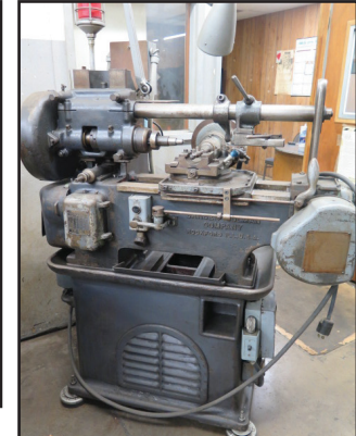
Barber-Colman No.3 Gear Hobbing Machine