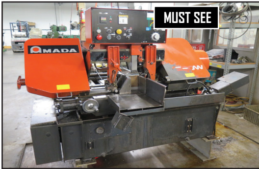
Amada HA-250W 10" Horizontal Band Saw