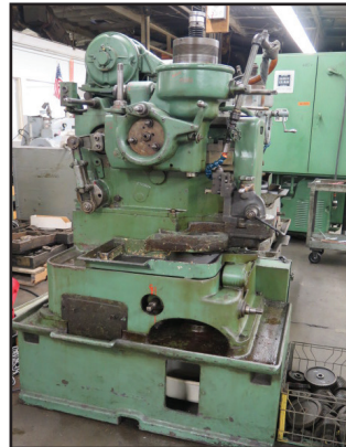
Fellows "Hydrostroke" FS-400-125 CNC Gear Shaping Machine w/ Fellows CNC Controls