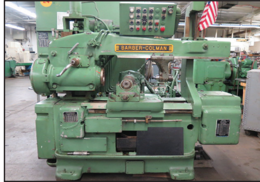
Barber-Colman 16-16 16" x 16" Hydraulic Gear Hobbing Machine w/ Gear Sets