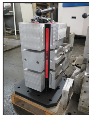
Chick Tombstone Vises