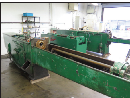
Horizontal Broaching Machines