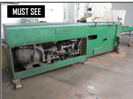
LaPointe Type HP-15 7.5 Ton Horizontal Broaching Machine