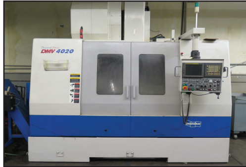
2007 Doosan DMV4020 CNC VMC w/ Fanuc 21i-MB Controls, 24-Side Mount ATC, CAT-50 Spindle, Thru-Spindle Coolant, Rigid Tapping