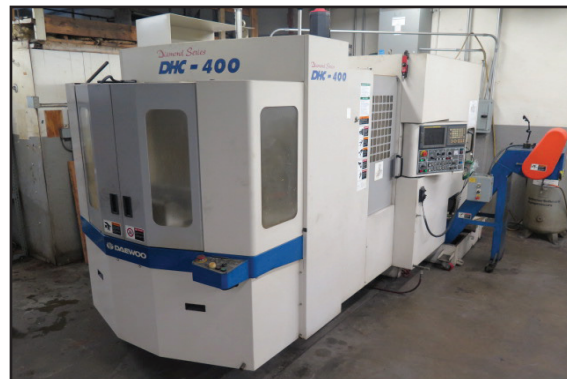
2005 Daewoo DHC-400 Pallet 4-Axis CNC HMC w/ Fanuc 21i-MB Controls, 40-ATC, CAT-40 Spindle, Tool Presetter, Thru Spindle Coolant