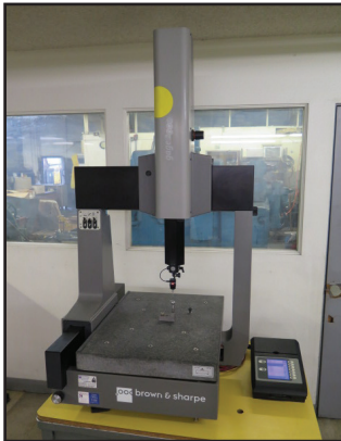
1998 Brown & Sharpe "Gage 2000" CMM Machine w/ Brown & Sharpe Controls, Renishaw TP-ES Probe Head