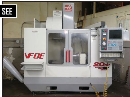
2001 Haas VF-0E 4-Axis CNC VMC w/ Haas Controls, 24-Side Mount ATC, CAT-40 Spindle, 7500 RPM, Rigid Tapping