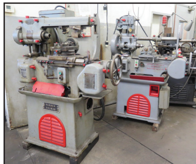
Barber-Colman Gear Hobbers