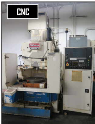
Fellows "Hydrostroke" FS-400-125 CNC Gear Shaping Machine w/ Fellows CNC Controls

Amada HA-250W 10" Automatic Hydraulic Horizontal Band Saw s/n 23550058 w/ Amada Controls, Chip Auger, Conveyor, Coolant. Nugier C-10-16 10 Ton Hydraulic Press s/n 0482007 w/ 20" x 12 1/2" Bolster. Advanced Hydraulics C8-8-8 Ton Hydraulic Press s/n 1525 w/ 16" x 12" Bolster. Sunnen MBB-1660 Honing Machine s/n 84942 w/ Coolant. Rockwell Variable Speed Pedestal Drill Press. 5-Speed Pedestal Drill Press. (2) Parts Washers.