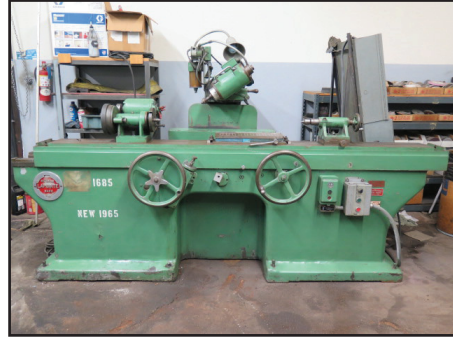
LaPointe Size 72 Broach Sharpener