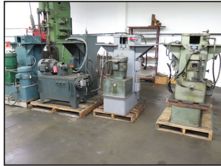
Pioneer Broaching Machines