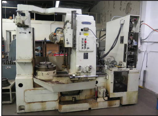
G & E Norton 24H Gear Hobbing Machine w/ 18" Table, 40-240 RPM