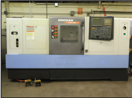
2008 Doosan PUMA 280 CNC Turning Center w/ Fanuc 21i-TB Controls, Tool Presetter, 10-Station Turret, Tailstock, 12" Power Chuck