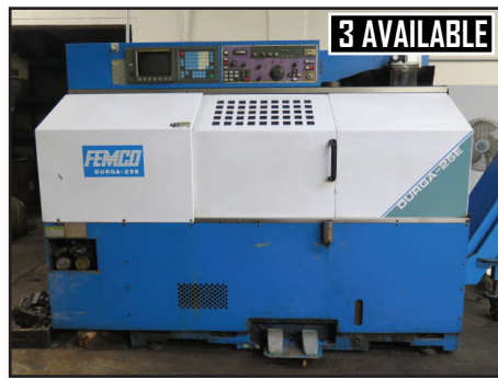
Femco DURGA-25E CNC Turning Center w/ Fanuc 0-T Controls, Tool Presetter, 12-Turret, Tailstock, 8" Power Chuck ***3-AVAILABLE***