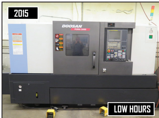
2015 Doosan PUMA 2600 CNC Turning Center w/ Fanuc I Controls, Tool Presetter, 12-Station turret, Tailstock, 12" Power Chuck

PRECISION CNC MACHINING / BROACHING & GEAR CUTTING FACILITY