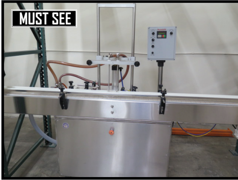
MUST SEE 1997 Accutec VF-2 Automatic 2-Station Filling Machine w/ Digital Controls