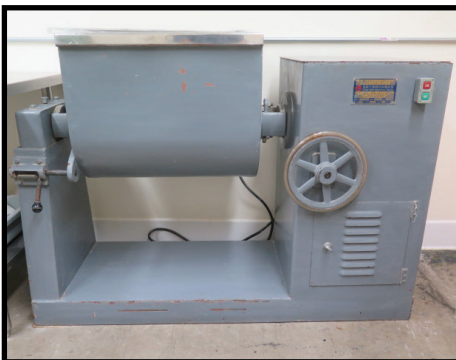
Chaun Yung Ind CY-PL-4 Industrial Mixer w/ Stainless Mixing Bowl and Blade