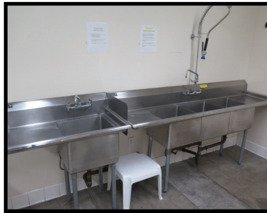
Stainless Steel Sinks and Wash Basins