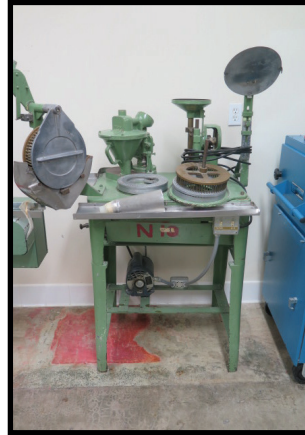
Small Semi-Automatic Capsule Filling Machine