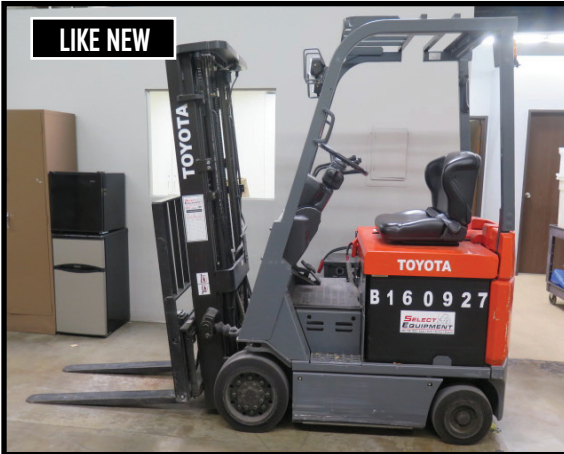
Toyota 7FBCU10 2900 Lb Cap Electric Forklift w/ 3-Stage Mast, 189" Lift Height, Side Shift