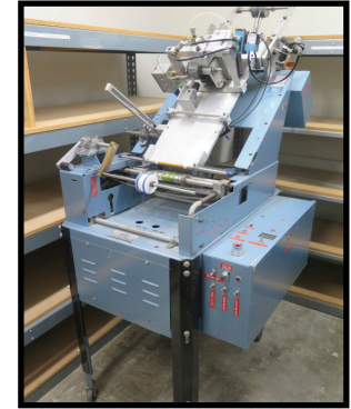
Labelette mdl. SPS Label Imprinter