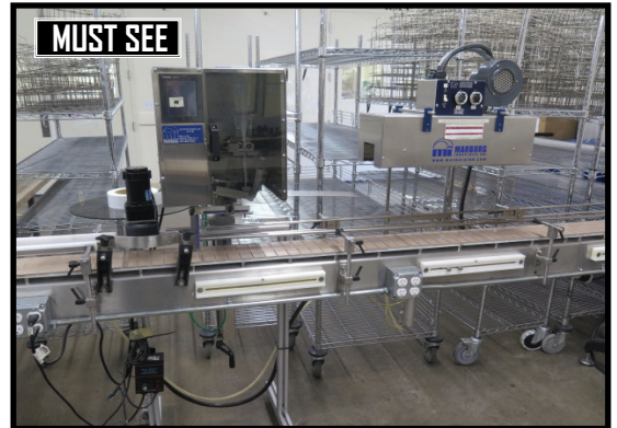
MUST SEE Marburg M-5GT Auto Cap-Sealer Banding Machine w/ Marburg CR-6000 Heat Tunnel