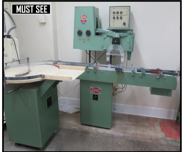
King Modular Packaging Systems 2-Bottle (Capsule) Filling Machine w/ Bendix Controls