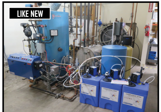
LIKE NEW Superior Boiler Works mdl. GMS-900-HP-HEP Gas Boiler w/ Power Flame Inc NPMR30A-12-120 Heat Box and Controls, Chem-Aqua Boiler Treatment System