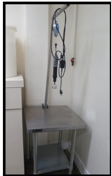
Sumake ED-645P1 Manual Capper w/ Stainless Steel Table

Toyota 7FBCU10 2900 Lb Cap Electric Forklift s/n 66256 w/ 3-Stage Mast, 189" Lift Height, Side Shift, Cushion Tires, Charger. Global 5500Lb Cap Pallet Jack. (10) Sections of Pallet Racking. (32) Wire Frame Rolling Shelves. (2) 3' x 8' Stainless Steel Tables. (2) Maple-Top Work Benches. (6) Stainless Steel 2 and 3-Basin Sinks. Employee Lockers. Packaging and Shipping Supplies. Approx 39,000 16oz Amber Glass Bottles. Approx 288,000 Assorted Bottle Caps.