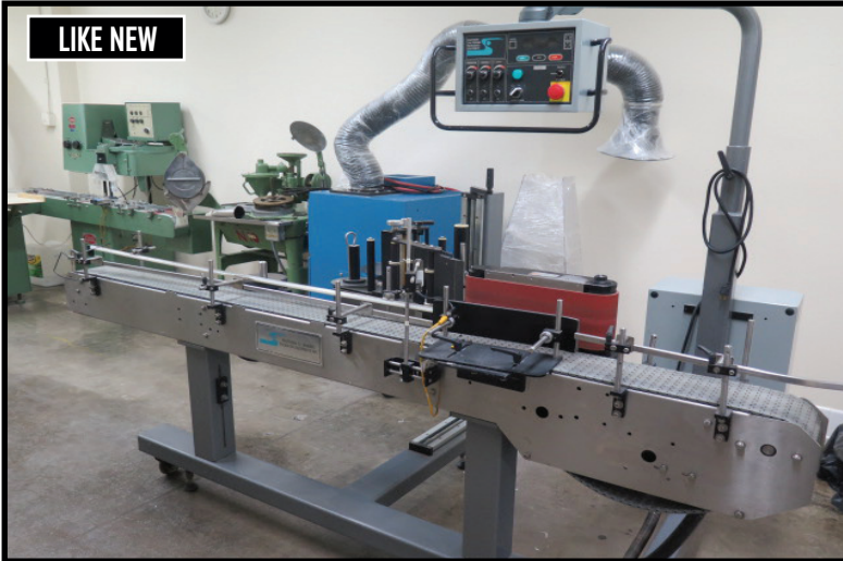
Southern California Packaging Equipment mdl. ST-1100 Automatic Labeling Machine w/ Digital Controls