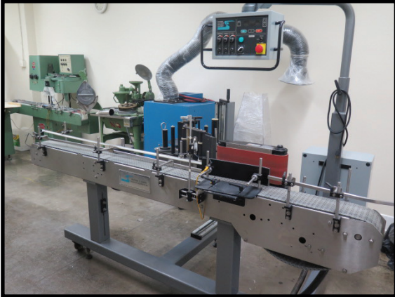
Southern California Packaging Equipment mdl. ST-1100 Automatic Labeling Machine w/ Digital Controls

PRESORTED First-Class Mail U.S. Postage PAID STA CLARITA, CA Permit No. 298