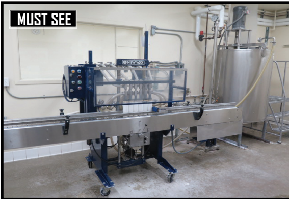
MUST SEE New Way 6-Station Semi-Automatic Filling Machine w/ Scott Turbine 200 Gallon Stainless Steel Tank, Stainless Steel Diaphragm Pump, Valves and Hoses

NUTRITIONAL & DIETARY SUPPLEMENT MFG FACILITY