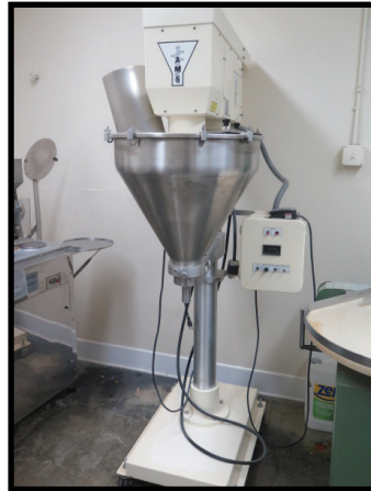
Scanlan-Morris / Ohio Chemical and Surgical Equipment Co. mdl. A526R Steam Sterilizer