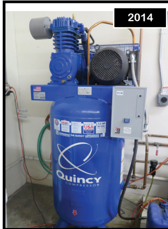
2014 Quincy mdl. 271CS80VCB 7.5Hp Vertical Air Compressor w/ 80 Gallon Tank

Lab : Mark-10 mdl. MTT01-25 Digital Cap Torque Tester w/ Mitutoyo DP-1VR Recorder. Brookfield mdl. RVT Viscometer s/n 8487614 w/ RV Spindle Set. Mogul Micromhos Meter. Met One Instruments GT-321 Particle Monitor. Oakton Acorn Series TDS6 TDS/Degree C Meter. Ika "Equrostar 40" mdl EURO-ST 40 D S1 Digital Laboratory Stirrer. Cole-Parmer "Stir-Pak" mdl. 4554-00 Laboratory Stirrer. Ohaus "Scout-Pro" 200g Digital Scale. (3) Ohaus Triple-Beam Scales.