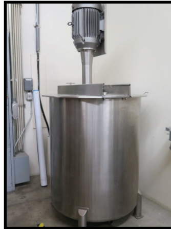
Scott Turbon Mixer Co. mdl. 310-US-GAL Stainless Steel Mixer