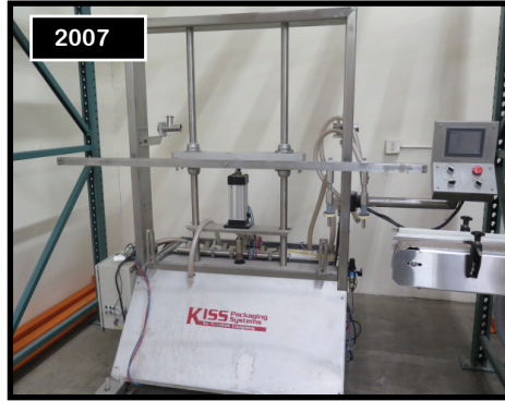
2007 2007 Accutec / Kiss Packaging Systems mdl. 04-5020P01 6-Station Filling Machine s/n A17201623 w/ PLC Controls