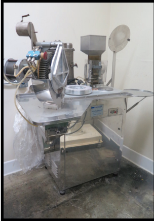
Shiongi Qualicaps "Quali-Fill" mdl. 8S Semi-Automatic Capsule Filling Machine