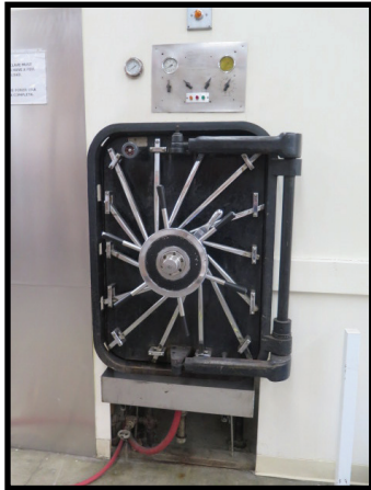
Scanlan-Morris / Ohio Chemical and Surgical Equipment Co. mdl. A526R Steam Sterilizer