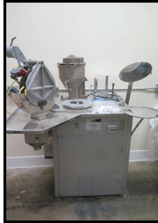
Elanco No. 8S Semi-Automatic Capsule Filling Machine