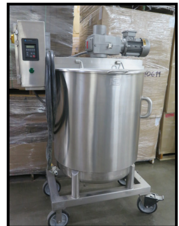
Scott Turbon Mixer Co 2SSA-120GA Stainless Steel Mixer w/ Digital Controls, 120 Gallon Jacketed Tank