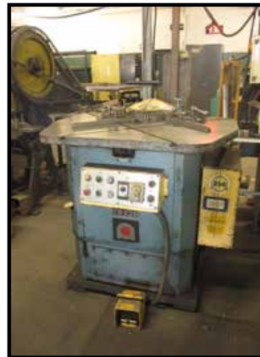
Amada CS-220 Power Corner Notcher