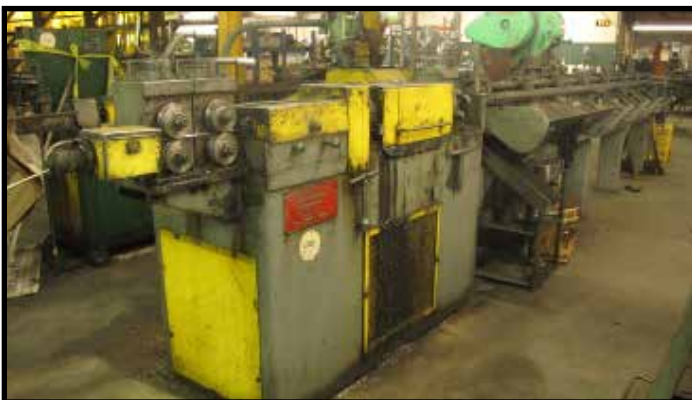
Patterson 8A-COM Wire Straightening / Cutting Machine