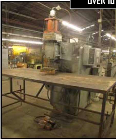
Sciaky Projection Welder