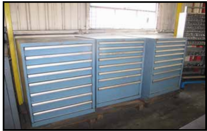
CNC Punch Tooling w/ Cabinets