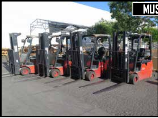
Linde E20 3750 Lb Cap Electric Forklifts