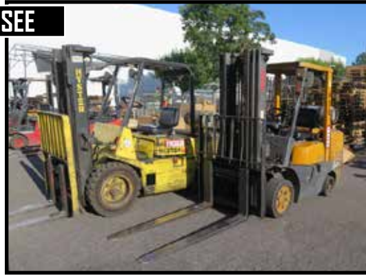
Hyster and TCM Forklifts