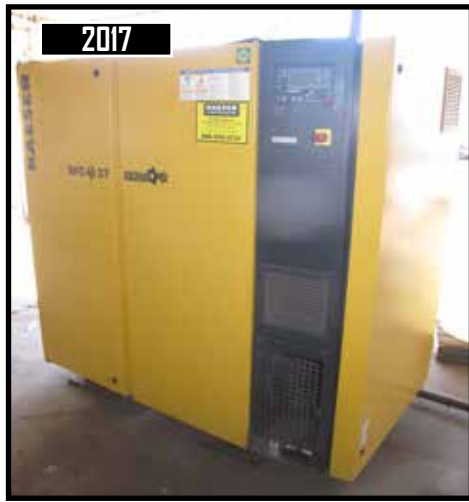
2017 Kaeser SX7.5 7.5Hp Rotary Air Compressor