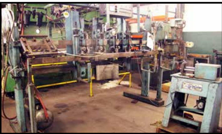
Lebow 4-S-A 4-Head Pneumatic Frame Wire Bender