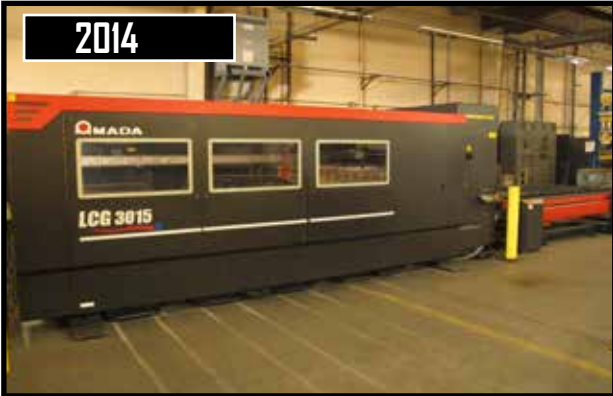
Amada LGC3015 CNC Laser Contour Cutting Machine w/ AMNC PC Controls w/ Flying Bridge