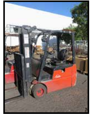
Linde E20 3750 Lb