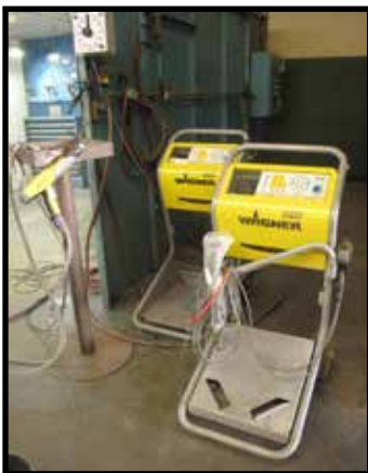
Wagner EPG-Sprint X Powder Paint Spray Systems