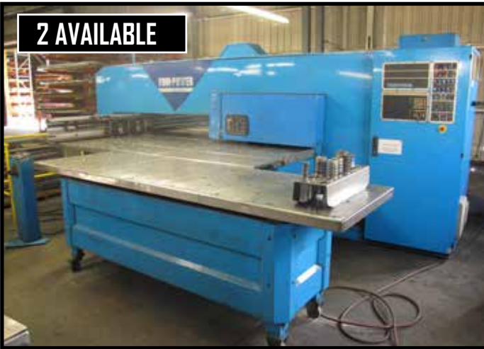
Finn-Power type TP2520 IF2/21/AM 30 Ton CNC Turret Punch Press **2-AVAILABLE**