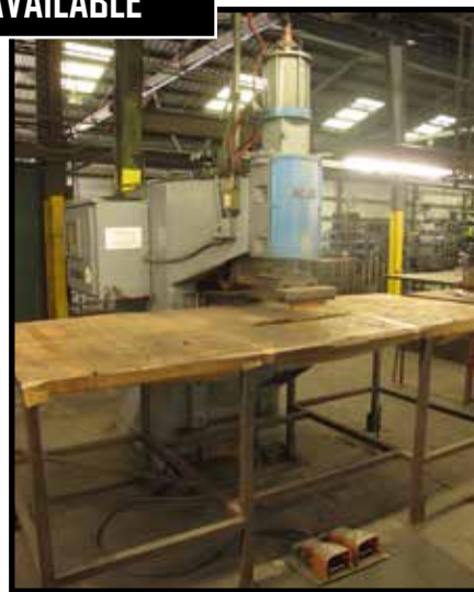
Acme 150kVA Projection Welder