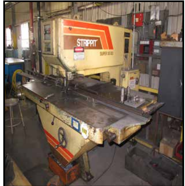
Strippit Super 30/30 30 Ton Duplicator Press