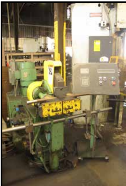
Pines M-60030 Hydraulic Pipe Bender w/ Dial-A-Bend Digital Controls