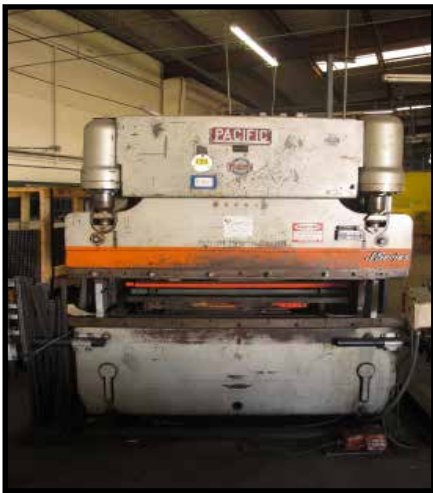
Pacific J55-6 55 Ton x 6' Hydraulic Press Brake