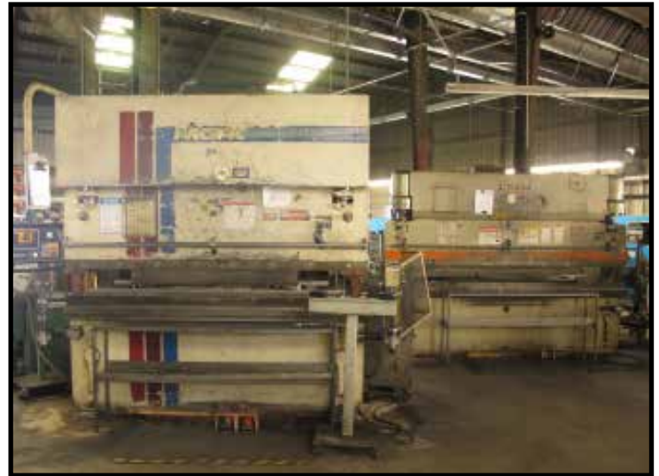
Press Brake Department