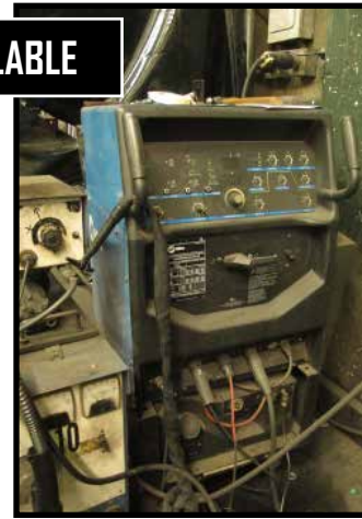
Miller Syncrowave Tig CC-AC/DC Arc Welders