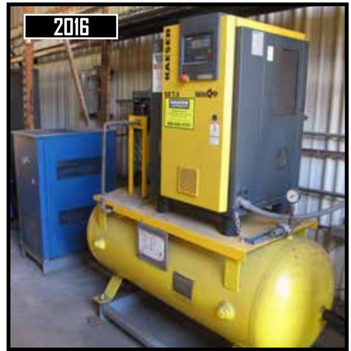
2016 Kaeser SFC37 50Hp Rotary Air Compressor