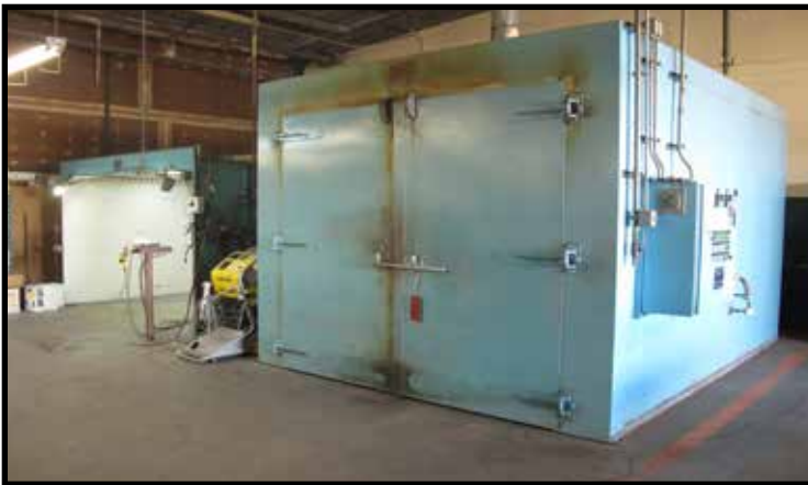
Industrial Press Equipment 9' x 12' Natural Gas Batch Oven & Spray Booth