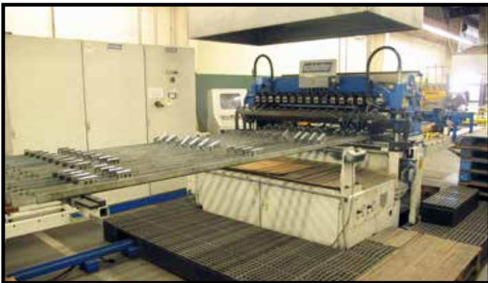
Schlatter Leistundsschlater 60" CNC Mesh Welder