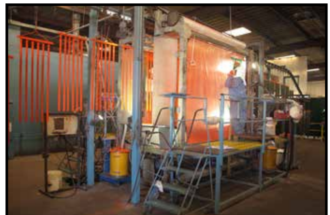
Industrial Powder Coating Spray Booth