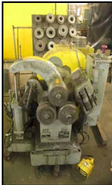
Buffalo No. 2VBR Roll Former