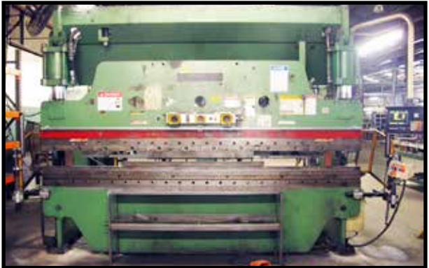
Cincinnati 135CB-10 135 Ton x 10' CNC Hydraulic Press Brake w/ Autobend 5C Controls