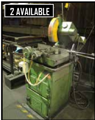
Doringer D350 Miter Cold Saw