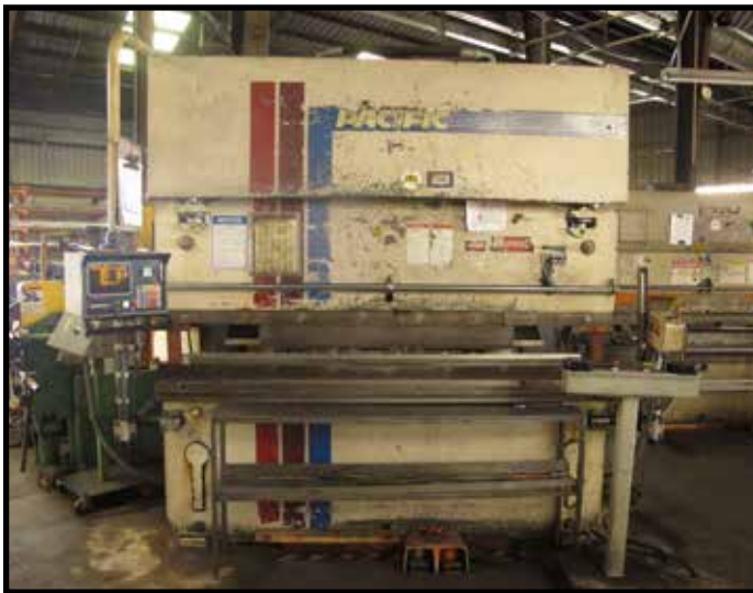
Pacific J110-8 73 Ton x 8' CNC Hydraulic Press Brake w/ Hurco Autobend 7 Controls