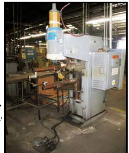
Acme 100kVA Spot welder