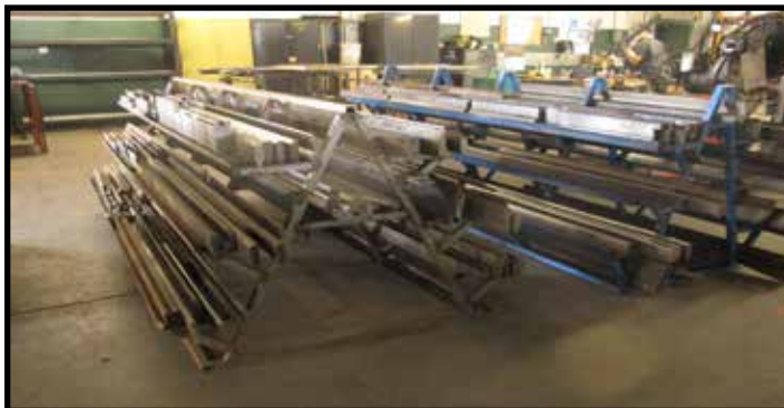
Press Brake Tooling w/ Racks