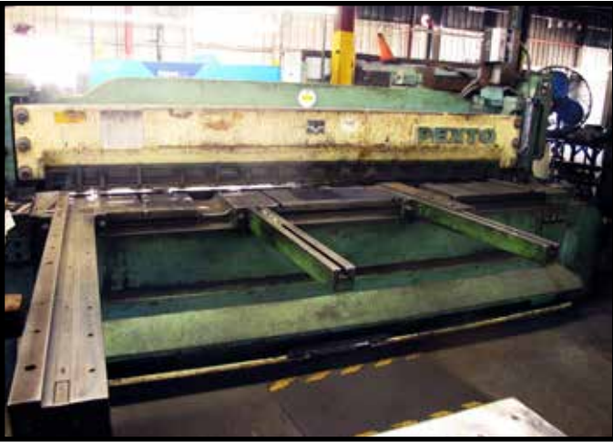
Pexto 1018 18GA x 10' Power Shear