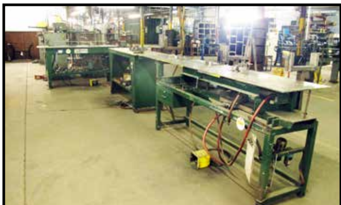
Lubow Rotary Table Benders