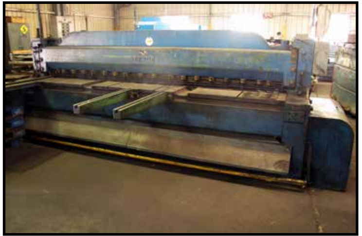
Pexto 10-U-10B 10Ga x 10' Power Shear