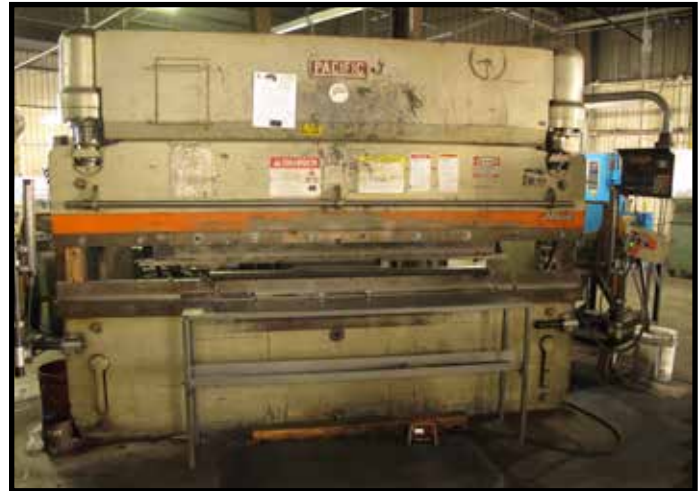
Pacific J7S-10 10GA x 8'4" CNC Hydraulic Press Brake w/ Hurco Autobend 7 Controls