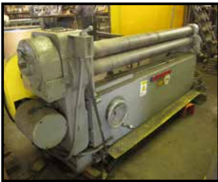
Wysong mdl. B-60 60" Power Roll